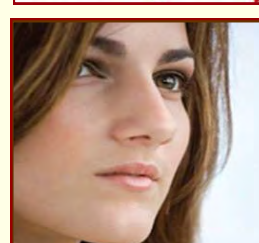
Walking with Love alternatives to abortion and responses to abortion