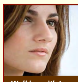
Walking with Love alternatives and responses to abortion