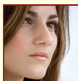
Walking with Love alternatives and responses to abortion